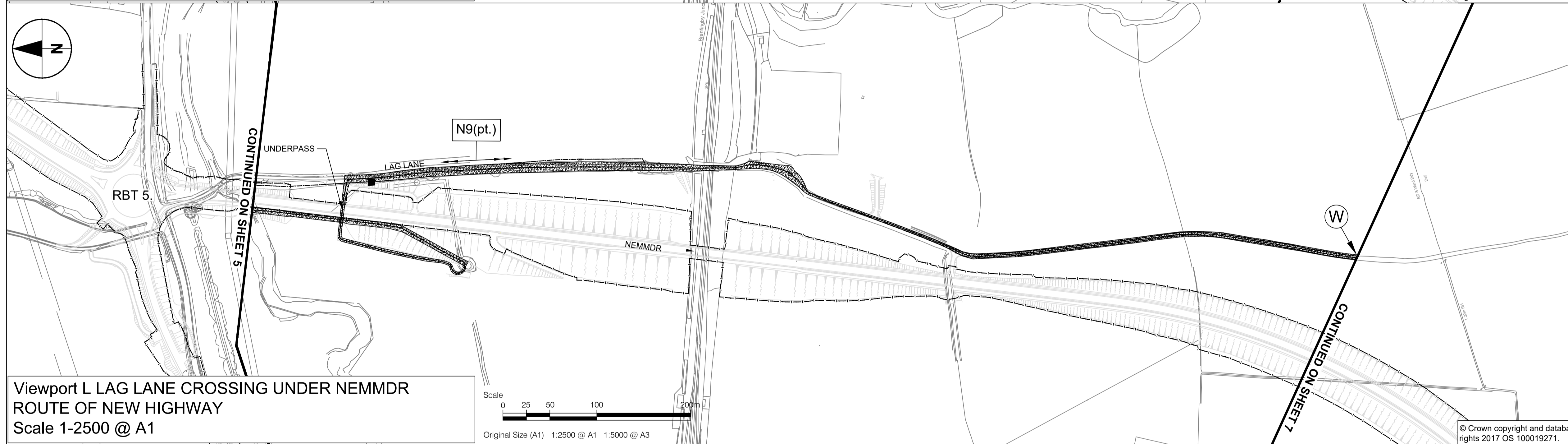
Viewport L LAG LANE CROSSING UNDER NEMMDR ROUTE OF NEW HIGHWAY Scale 1-2500 @ A1